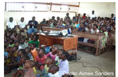
Students at a Mayumba school watch a double feature.

Over 140 students participated in a school clean up competition this month. The winning class received a colorful poster to decorate their classroom.