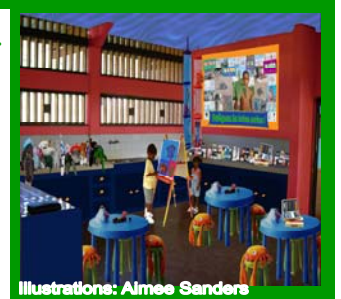
Illustrations: Aimee Sanders