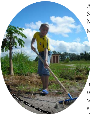
A student in Mayumba helps clean up his school.

A line was drawn in the sand. Students at Public School C in Mayumba took their mark, grabbed rakes and trash bags, and started cleaning. Each class cleaned up a pre-determined section of the school’s playground, removing broken glass, discarded oyster shells, and plastic bags that can pose a danger not only to humans but wildlife as well. Students here are well aware that the leatherback turtle’s favorite food is jellyfish, and that plastic bags that end up in the ocean can be mis-