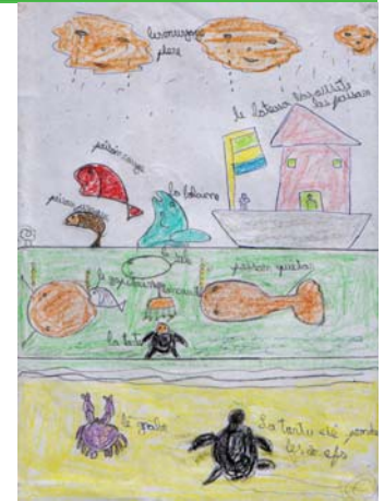
This drawing by Lucreche, a fourth grader at the school in Mayumba's fishing village, depicts the richness she sees in our marine environment.

whales and fisherfolk. These drawings will make their way back across international lines to the kids in Phoenix, or San Diego, or Bahia de los Angeles, Mexico. So far, over 500 elementary school students have participated in this exchange, which attempts expand children's concepts of the environment and demonstrate that they have friends around the world who value the environment just like they do, overcoming language barriers through the universal language of art.